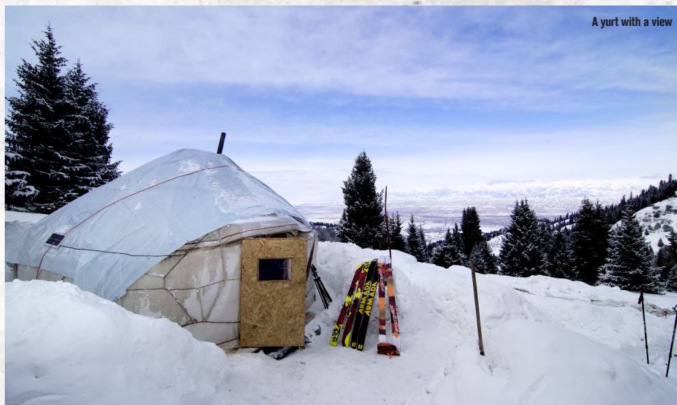
A yurt with a view

The yurt we're staying in, called Jalpak Tash,